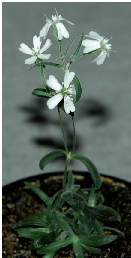
A prehistoric plant resurrected from frozen tissue.