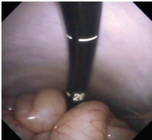
Figure 2 A retroflexed view after transgastric access showing the parietal peritoneum and bowel loops.

not intended to be used for organ resection, tissue retraction or apposition, suturing, or other surgical procedures. Basic necessities for minimally invasive surgery such as triangulation cannot be achieved with standard therapeutic endoscopes. The use of intraluminal accessories for transluminal surgery is somewhat analogous to driving a nail with a screwdriver. The lack of appropriate tools has led to increased collaboration among surgeons, gastroenterologists and industry experts for the development of tools specifically designed for transluminal surgery. NOTES tools would address issues