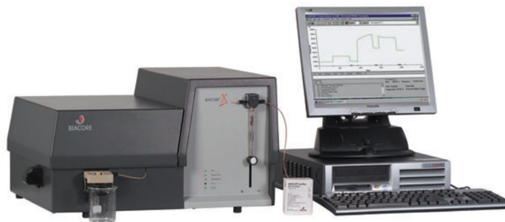
The Biacore T100 model to study protein binding on arrays.

and if it's in the liver is it in the membrane, cytoplasm or nucleus?" says Hadjisavas.