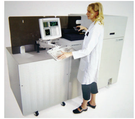
The IN Cell 3000 Analyzer from GE Healthcare.

A more tailored approach to HCS software is available in Cellomics' family of BioApplications, designed for measuring specific phenomena in cells, such as neurite outgrowth or nuclear translocation, or for more general functions, such as compart-