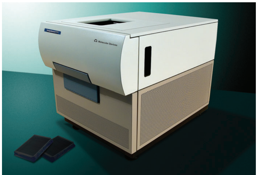
Molecular Devices' newly released imager, the ImageXpress Micro.

Both investigators have become champions of what is now known as high-throughput imaging, or high-content