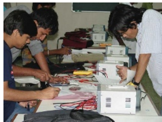
India plans to pay science students.

“We are planning to fund 30 new Central Universities, five new Indian Institutes of Science Education and Research, eight new Indian Institutes of Technology, and 20 new Indian Institutes of Information Technology,” Singh said. In the next five years, he added, India will also