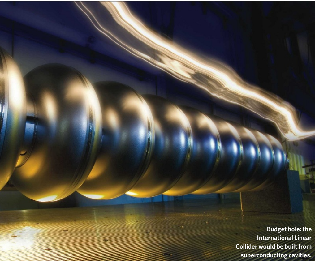
Budget hole: the International Linear Collider would be built from superconducting cavities.