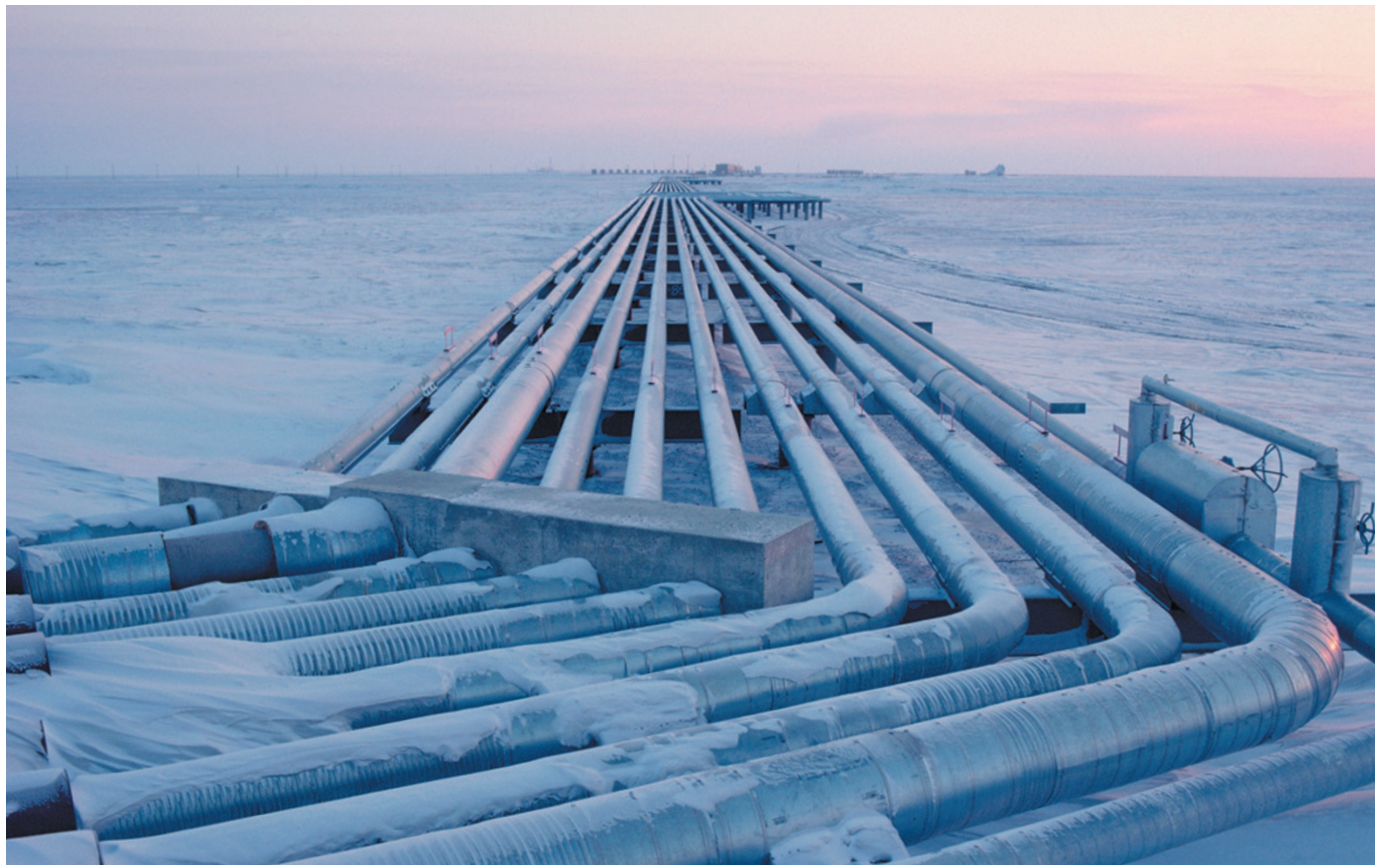
Pipes transport oil from rigs on Endicott Island in Alaska.