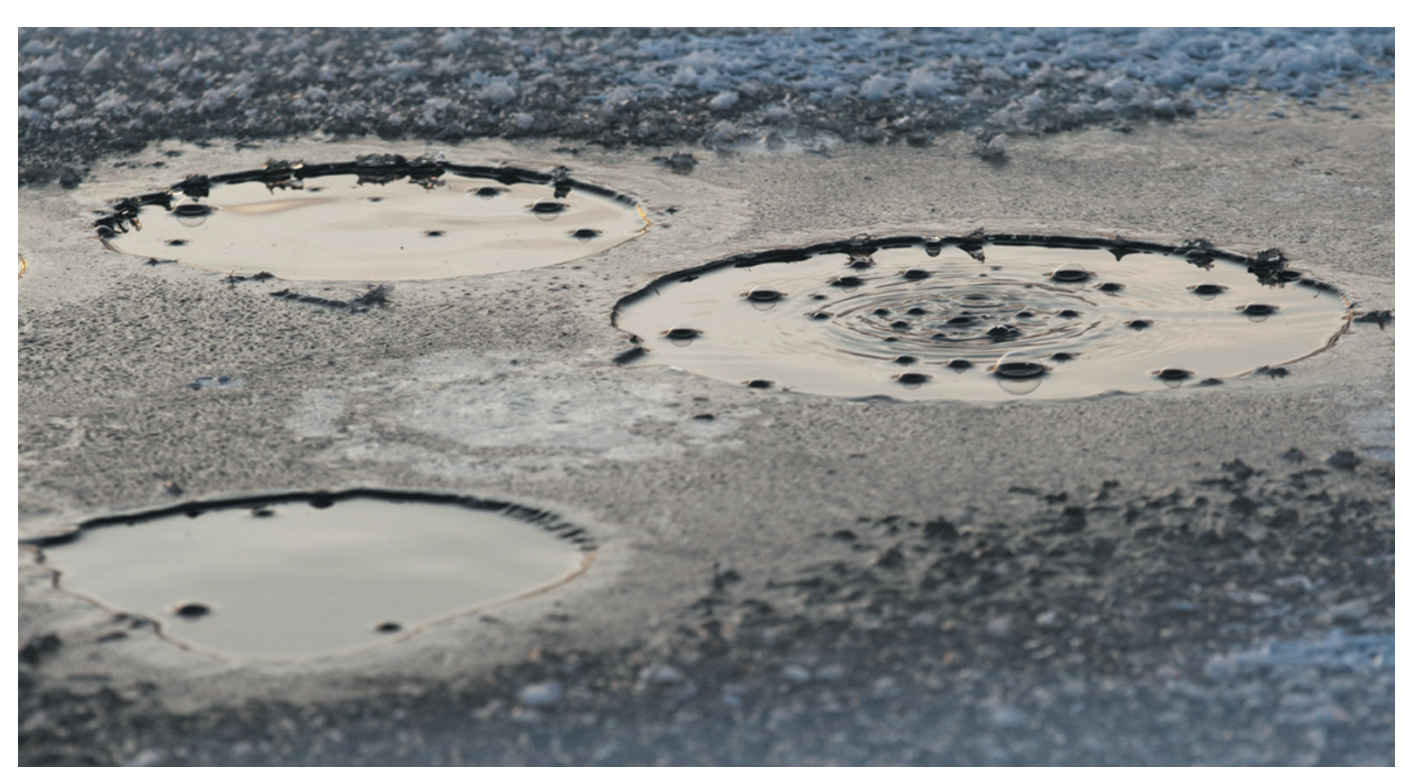
Bubbles of methane emerge from sediments below a frozen Alaskan lake.

• agricultural production as Arctic warming affects climate. All nations will be affected, not just those in the far north, and all should be concerned about changes occurring in this region. More modelling is needed to understand which regions and parts of the world economy will be most vulnerable.