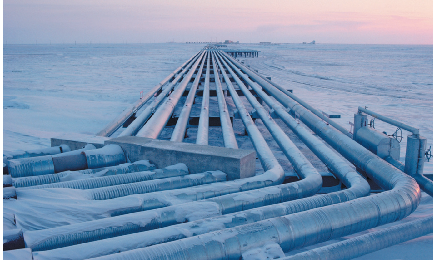
Pipes transport oil from rigs on Endicott Island in Alaska.

OBITUARY Jerome Karle, crystal structure mathematician, remembered p.410