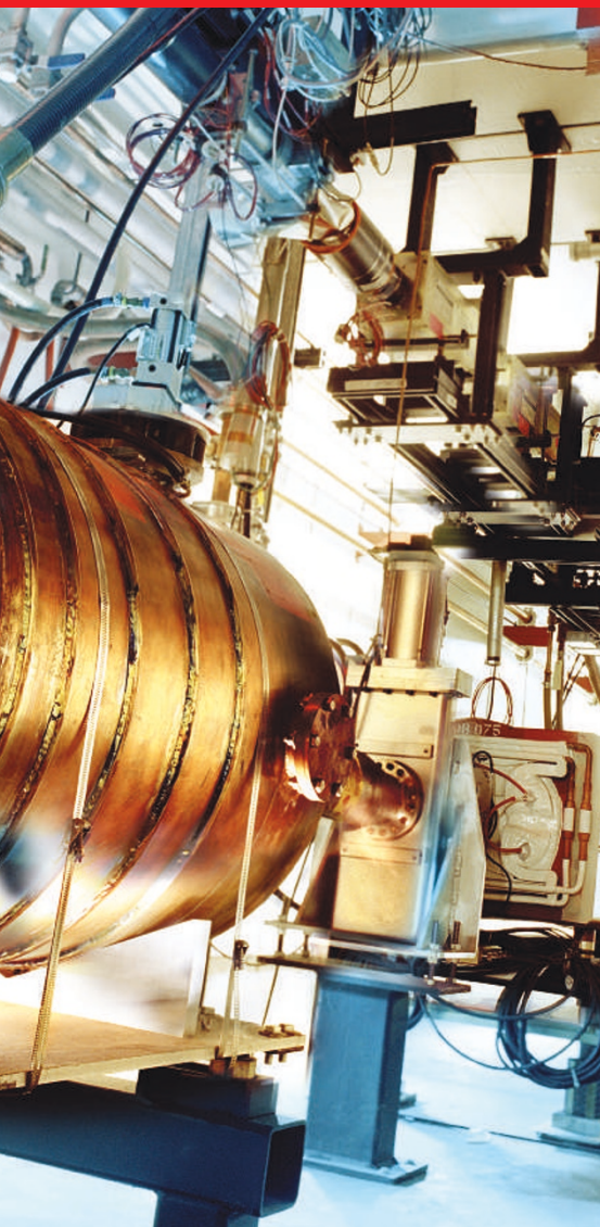
Power cut? The Tevatron particle accelerator in Illinois, the world's largest, may be suspended.

7.8% boost in its $5.6-billion budget. The agency was hoping to use the funds to increase the number of grants and launch its participation in the International Polar Year, says Jeff Nesbit, the NSF's director of legislative and public affairs. Under flat funding, he estimates that the agency would eliminate around 600 new grants, 10% of the number it was hoping to grant next year. Polar-year activities would also be jeopardized (see 'Shrunken heavyweight undermines polar year'), as would the start of a new petascale computing centre. Plans for the new EarthScope programme of geological monitoring might have to be slowed, and travel has been severely curtailed.