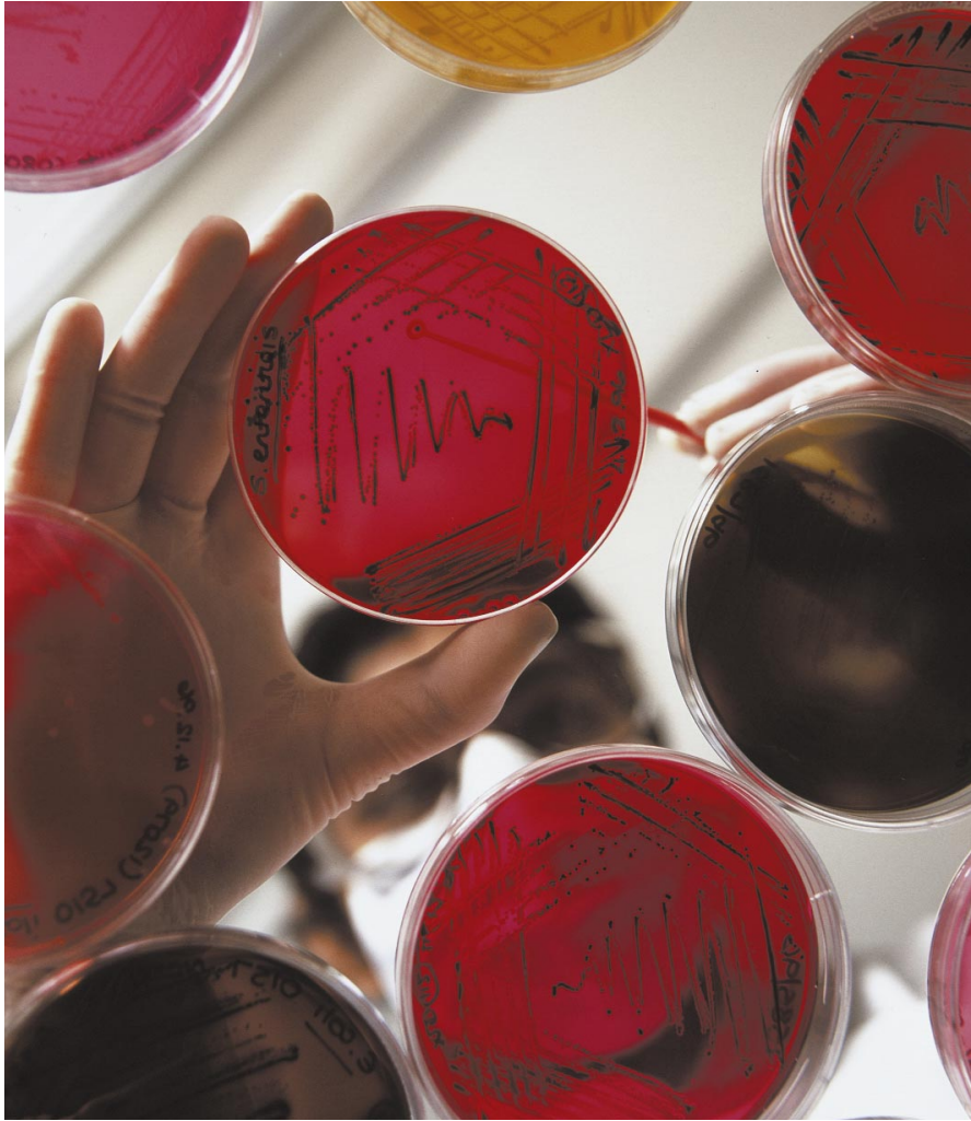
Petrified? Lab-based researchers will need to swallow their fears and embrace computational biology.

in raw sequence data. And genome browser programs allow users to see whole chromosomes and to zoom in on regions of interest, while simultaneously superimposing associated information such as data on homologous genes from other species.