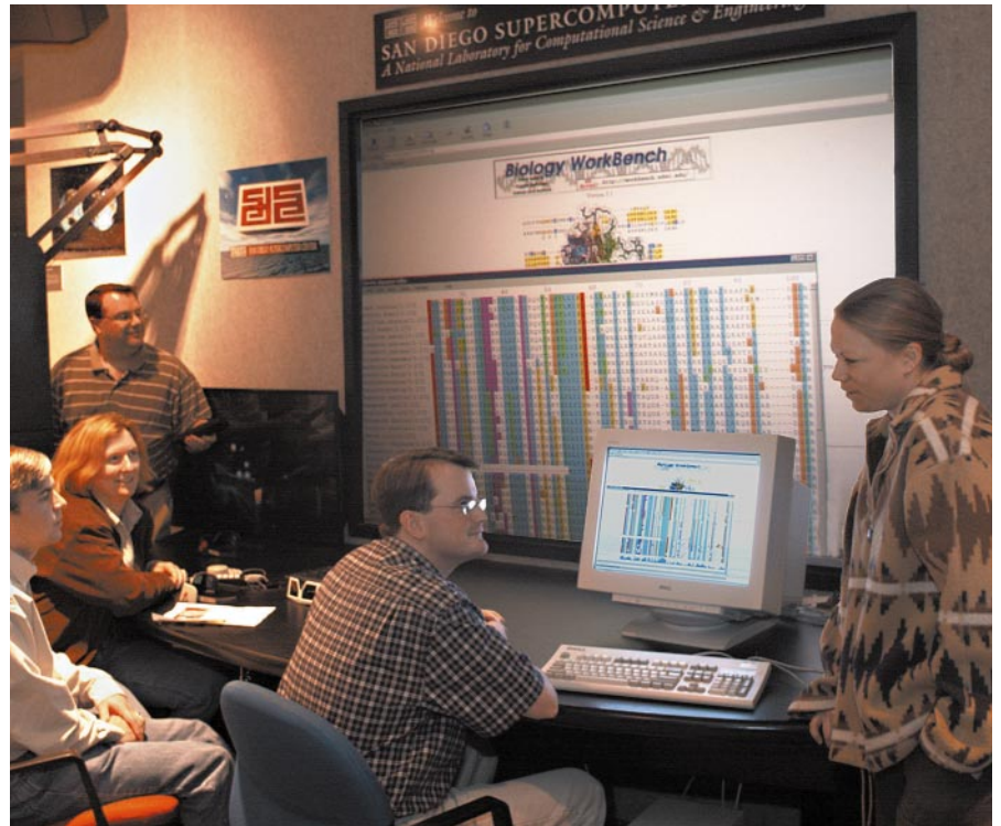
Shape of things to come: large data sets arising from genome projects demand new skills of biologists.

If so, those who learn to conduct high-throughput genomic analyses, and who can master the computational tools needed to exploit biological databases, will have an