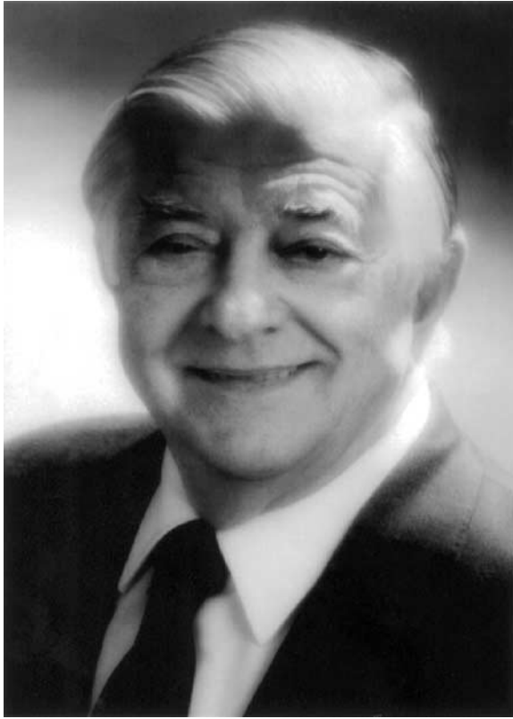
Figure 2 Nathan B Friedman. Coauthor (with Dr Moore) of seminal 1946 paper on testicular tumors.