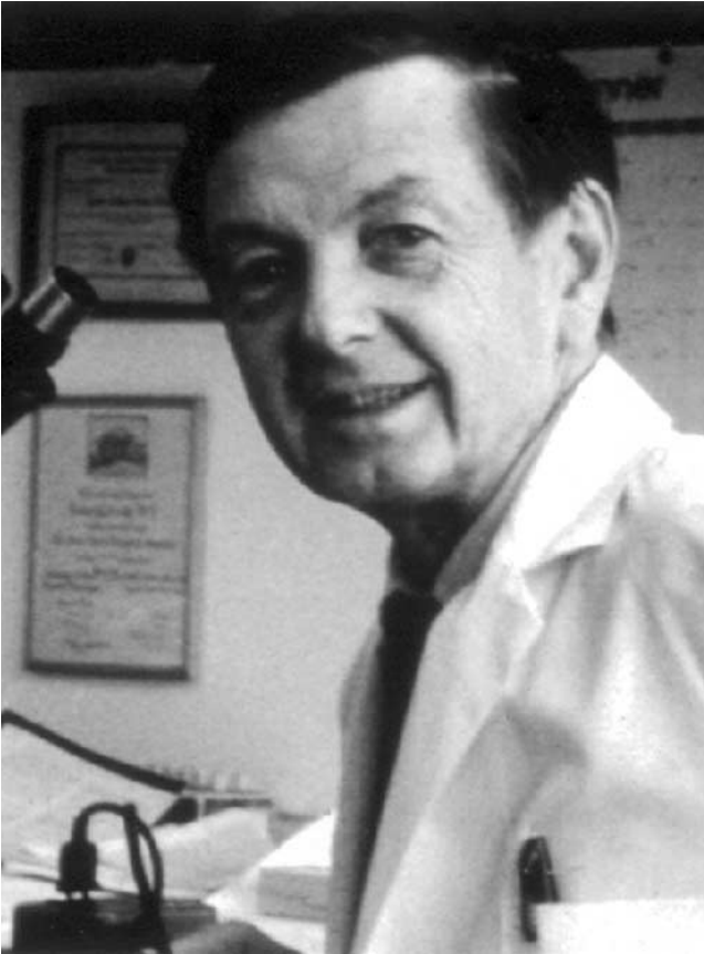
Figure 6 Robert E Scully. Master of gonadal and gynecologic pathology and architect of the modern classification of ovarian tumors.

Teilum was the first to draw significant attention not only to the occurrence of sex cord tumors of the testis but also to their similarity to ovarian neoplasms. 46–49 His last original paper on this topic in 1958 49 put his experience in perspective, and that paper was followed 1 year later by a major paper on this topic from the AFIP group under the leadership of Dr FK Mostofi (Figure 5) 50 that included the largest experience until that time. The combined observations of Teilum and the AFIP resulted in sex cord tumors of the testis becoming a defined subset of testicular tumors. At almost the same time, Dr Mostofi and colleagues at the AFIP contributed an important paper (with Dr John G Azzopardi as first author) on the remarkable phenomenon, seen only in the testis, of regression of a germ cell tumor, sometimes in the setting of extensive extratesticular spread. 51