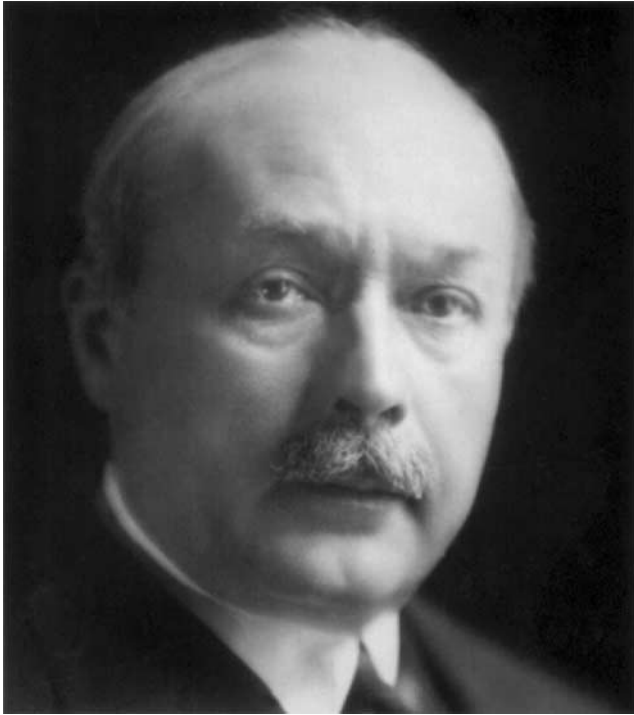
Figure 1 Maurice Chevassu. Famed urologist who described the seminoma.

In 1939, a French histologist, Albert Peyron, 14 described within a testicular teratoma the enigmatic and picturesque structures which are known in the English language as 'embryoid bodies'. Peyron was remarkably prolific on this topic; in a later contribution on the subject 15 no less than 17 papers of Peyron are cited! Neoplasms composed predominantly of embryoid bodies, polyembryomas, were subsequently described (in both gonads) and arguably are the most photogenic of all gonadal tumors. 16,17