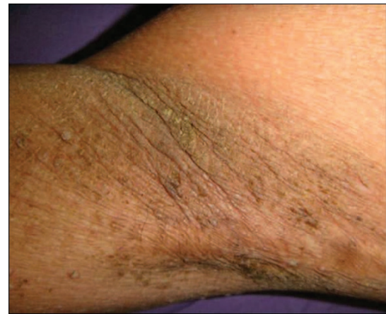
Figure 2 Hyperkeratotic and hyperpigmented skin in the axilla area.

5.0 cm×4.3 cm, which was proven to be metastases carcinoma in pathological biopsy. Biopsy of lips and axilla tissue showed hyperkeratosis, acanthosis, increased dermal pigmentation and papillomatous hyperplasia of the epidermis (Figure 3). Human papillomavirus DNA was not detected in the fluorescent quantitation analysis.