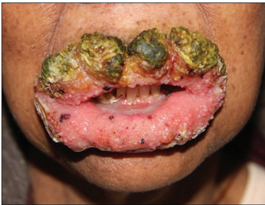
Figure 1 Clinical appearance of lips.

A 59-year-old woman was evaluated due to a 3-month history of oral papillomatosis on the lips. The patient had sialorrhea on account of the eversion of her tumefaction lips. The epichil was easy to bleed with a scab formation (Figure 1). Hyperkeratotic and hyperpigmented skin on the face, elbows, pudendum, groins, especially in the axilla area with some warty thickening of nipples, was followed by the appearance of velvety patchy lesions in these areas (Figure 2). In the patient's history, endometrial adenocarcinoma was diagnosed and treated with surgery of hysterectomy and bilateral salpingectomy nine years prior. The follow-up computed tomography scan of the chest detected an enlargement of the mediastinal lymph nodes. Both the computed tomography scan and ultrasounds of the abdomen and pelvis showed several vesicle and mixed-type masses, with the largest one being