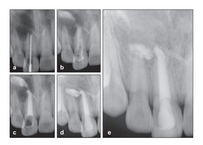
Figure 1 Radiographs of case 1. (a) The first visit during working length measurement. (b) The MTA extrusion into the periapical lesion during the one-step apexification. (c) Completion of MTA placement. (d) 11-month follow-up presenting the displacement of MTA. (e) 36-month follow-up showing complete resolution of periapical radiolucency around the extruded MTA. MTA, mineral trioxide aggregate.