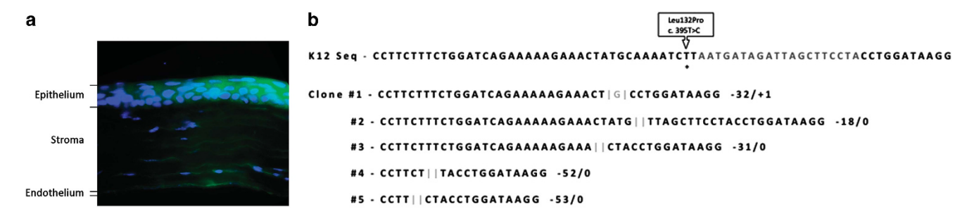
Figure 3. Demonstration of sgK12LP-induced NHEJ in vivo. GFP expression was observed in the corneal epithelium of mice at 24 h post intrastromal injection, demonstrating the efficacy of an intrastromal plasmid injection for transfecting the corneal epithelium ( \mathbf{a} ; N = 2). No GFP expression was observed 48 h post injection. Sequencing of the gDNA from human K12-L132P heterozygous mice injected with the sgK12LP construct demonstrated large deletions and the induction of NHEJ due to cleavage of the KRT12-L132P allele. Of 13 clones sequenced, 5 were found to have undergone NHEJ (b).

sgRNA recognition of its target site and Cas9-mediated cleavage of the exogenous luciferase reporter construct, luciferase mRNA transcription is disrupted and the plasmid becomes functionally silent. Neither NHEJ nor homology-directed repair need occur to observe this effect. Through utilization of dual-luciferase reporter assays, western blotting, quantitative reverse transcriptase-PCR and pyrosequencing the expression levels of wild-type and mutant K12 were quantified at both the mRNA and protein level. The Cas9/sgRNA complex using the SNP-derived PAM was found to be highly potent, similar to that of a positive control KRT12 sgRNA common to both wild-type and mutant alleles, and allele-specific, as demonstrated by no observable knockdown of wild-type K12 expression.