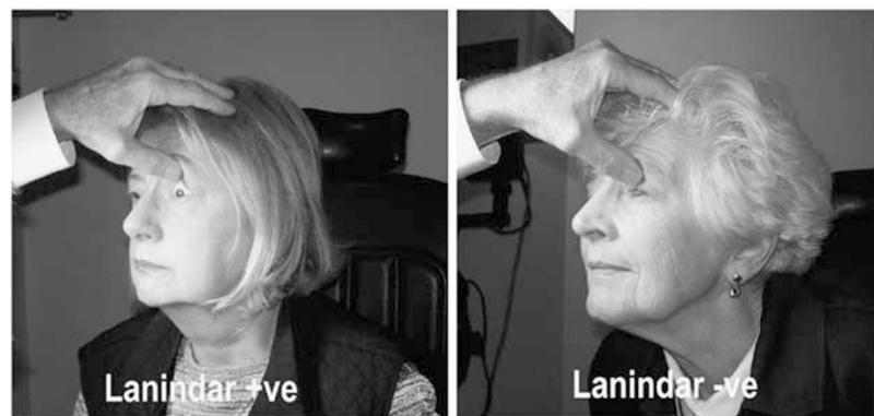
Figure 1 This figure indicates the Lanindar test: right panel—Lanindar-positive response; left panel—Lanindar-negative response.

Prior to surgery, either Midazolam (1–3 mg) or Alfentanil (100–300 µg) was used to provide appropriate sedation and anxiolysis. The dose of these medications