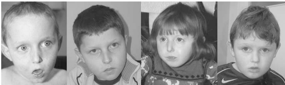
Figure 3 Composite of faces showing, from left to right, two siblings from family 1, one from family 2 and the proband from family 4. All demonstrate similar hypotonic facies, narrow nose, prominent forehead and deep-set eyes. The mouth and chin are relatively small and the skin is thin with visible veins.

Few authors have commented in great detail on the facial gestalt of the Xq28 duplication patients. Gargiulo for example, concentrated on the intestinal phenotype rather than including a description or photographs of facial features. We believe that there is a recognisable face (Figure 3). Families 1 and 2 were recognised as having the same syndrome on the basis of facial features as well as bowel symptoms several years before molecular diagnosis. Patient 4 was originally referred with a possible diagnosis of Angelman syndrome, but on the basis of his facial appearance, MECP2 duplication testing was undertaken. Most of our patients had a narrow 'pinched' appearance of the nose with a translucent quality of the skin and prominent veins. The eyes appeared deep-set and the chin prominent. The lower lip was frequently everted and small; widely spaced teeth were noted in some patients. A frontal cowlick was often present. We would agree with