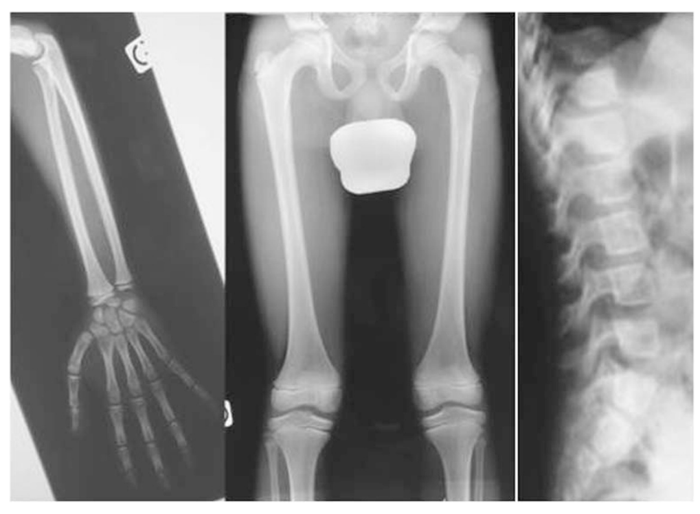
Figure 2 Skeletal features of a child at 7 years of age with 3M syndrome and without a CUL7 mutation. Note the long slender tubular bones and tall vertebral bodies.

Genomic DNA was extracted from peripheral blood by standard procedures. For mutation detection, we used 23 primers to amplify the 25 coding exons of CUL7 (primers available on request). We purified the PCR product with exonuclease I (ExoSAPIT; Amersham Bioscience) according to the manufacturer's instructions. Sequencing reactions were run on an ABI 3130 sequencer using a dye terminator cycle sequencing kit (Applied Biosystems) and analysed by sequencing analysis (Applied Biosystems).