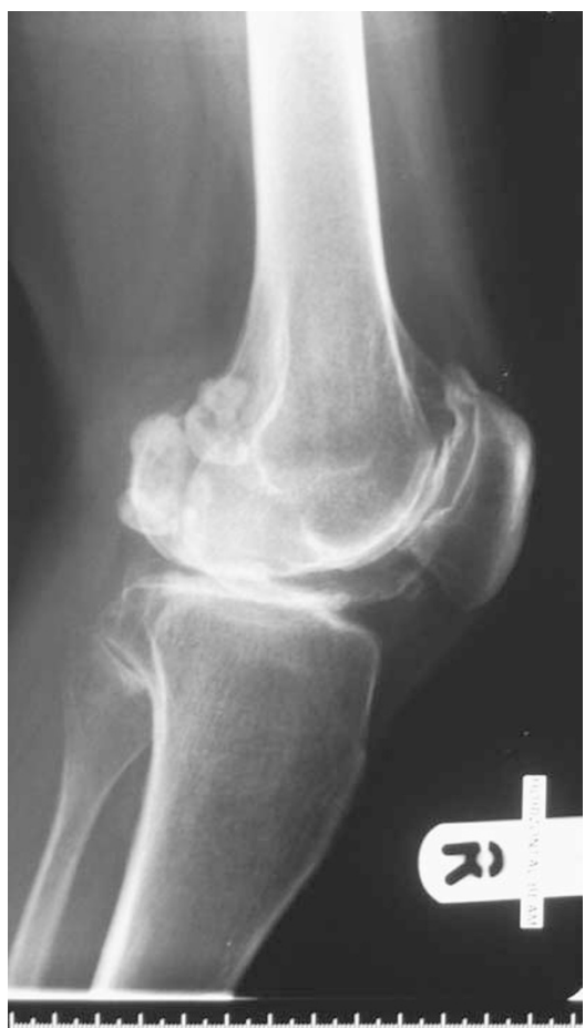
Figure 2 Lateral radiograph of the right knee in patient SB0304240 shows osteochondromatosis lesions in the posterior part of the joint.

There is evidence that substituting a hydrophilic arginine by a hydrophobic cysteine within the triple helical domain of the collagen protein affects the integrity and stability of the collagen fibril. Previous analyses have shown that arginine is the most stabilizing residue in the Y-position of the Gly-X-Y repeat. 12 On the basis of the collagen stability algorithm ( http://jupiter.umdj.edu/collagen_calculator/ ), we can calculate that the R275C mutation causes local destability of the procollagen chains ( \Delta T = 1.22^\circ\text{C} ). 13 However, Steplewski et al 14 did not notice any change in thermostability of the entire pro- \alpha 1(\text{II}) collagen chain containing R275C. This observation suggests that the mutation only affects local thermostability without adverse effect upon the entire collagen chain. Cysteine residues are absent in the triple helical domain of the pro- \alpha 1(\text{II}) collagen chain. 12,15 When introduced by mutation, cysteine residues may engage in creating either intramolecular or intermolecular disulfide bonds and hence unfavorably affect the supramolecular conformation