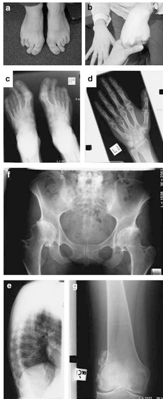
Figure 1 Clinical and radiographic pictures of patient AD0603929. There is shortening of the third to fifth toes on both feet (a). Brachydactyly with absent knuckle sign for the fourth finger is shown on the left hand (b). Anteroposterior radiographs of both feet reveal shortening of mainly the fourth and fifth metatarsals (c). The short fourth metacarpal is visible on the left-hand radiograph (d). Platyspondyly with irregular and sunken endplates is seen on the lateral radiograph of the thoracic spine (e). Anteroposterior radiographs of pelvis and right knee show respectively coxarthrosis (f) and osteochondromatosis lesions in the knee joint (g).

patients with this R275C mutation have been reported in the literature and all of them share the same clinical and radiographic features (Table 1). 4,7–11