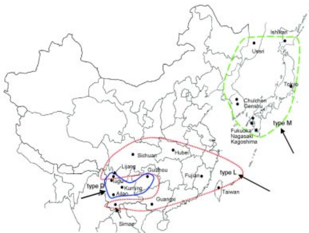
Fig 2. Map of East Asia showing the geographic distribution ranges of three kinds of karyotypes in natural populations of Drosophila lacertosa . Closed circles cover collection localities where flies were studied karyologically.

Table 2 shows the percentage of inseminated females in the crosses between five pairs of geographic strains with different karyotypes. These data represent percentage of females with sperm, which is inversely correlated with pre-mating isolation index (see "Materials and Methods"). Thus, no pre-mating isolation was observed for geographic strains within the same karyotype. Although the isolation index between