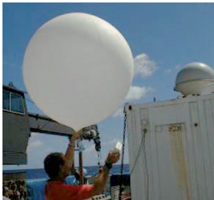
NATIONAL OCEANIC AND ATMOSPHERIC ADMINISTRATION

Int. J. Climatol. doi:10.1002/joc.1756 (2008) Until recently, data from satellites and weather balloons have shown less warming in the tropical lower atmosphere than on the land and ocean surface, a result inconsistent with model simulations and basic theory, and also at odds with the massive body of evidence on human-induced climate change. But this enduring conundrum in climate science has now been resolved.