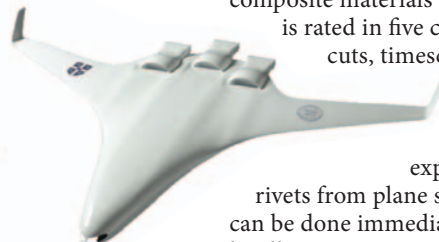
The 1935 Lockheed Electra (left), an early commercial airliner featuring a then-cutting-edge aluminium-alloy skin, overlooks the entrance to the Science Museum's exhibition of green aviation technology for the twenty-first century. Highly aerodynamic 'blended-wing' plane designs (right) may be seen on runways in 25 years.

The impact of aircraft on our future climate will be determined by, among other factors, the combined warming effects of all greenhouse gases. Quoting percentages of carbon dioxide alone makes the numbers more digestible, perhaps — it's the count most familiar to eco-conscious apportioners of pie slices — but far less meaningful.