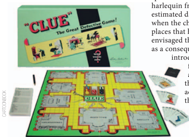
1949 first edition of Clue.

The authors claimed to refute the link between unusually warm years and frog disappearances: by adding random error to the data, they said, they were able to make the patterns go away 2 . It was quickly pointed out, however, that this approach is invalid 12 . By adding enough error to the relevant data, one could make some of the most harmful things on Earth appear harmless — even the energy policies of the Bush administration.