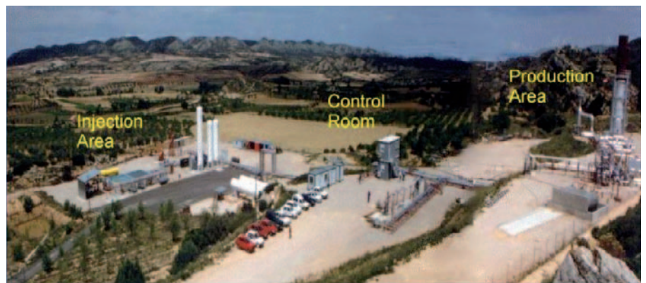
A UGC trial facility at El Tremedal in northeast Spain in 1998.

Environmentalists, however, remain sceptical about the technology, and about