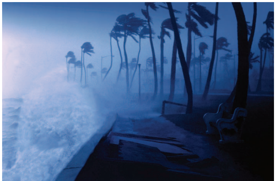
Should we be spending more on protecting ourselves against the adverse effects of global warming?

The book is a series of exercises in cost-benefit analysis, interspersed with quotes on climate change from the writings of famous people who should know better than to speak in hyperboles. Lomborg produces figures to show that it would be better to replace the Kyoto Protocol with strategies that encourage economic growth and blunt the harmful effects of