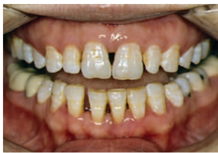
Fig. 14 Both central incisors have moved slightly bodily and are tilted mesially. The lateral incisors also have moved mesially, but to a lesser extent