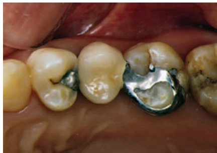
Fig. 16 A simple cantilever fixed prosthesis, which facilitates plaque control, replaces a second premolar tooth that was extracted because of a non-restorable situation

Heavy occlusal loading of the remaining teeth from tooth grinding and clenching, especially if the tooth roots are short and tapered and have reduced alveolar bone support following loss of the periodontal