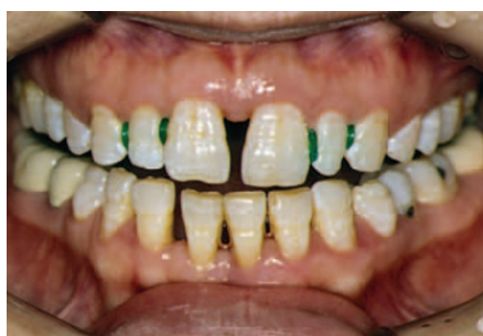
Fig. 13 Following comprehensive periodontal therapy, orthodontic elastic separators are placed interproximally to effect minor tooth realignment