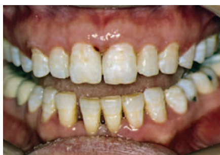
Fig. 15 The patient's appearance immediately following resin composite build-up restorations of the proximal tooth surfaces of the central and lateral incisor teeth

assists restorative treatment, but may also improve the subsequent long-term health of the periodontal tissues. Adjunctive orthodontic treatment should generally only commence once adequate plaque control has been achieved and periodontal therapy has been performed, and the periodontal tissues observed for resolution of inflammation and for healing. Care must be taken during orthodontic treatment to avoid adverse biomechanical forces being applied to teeth having reduced periodontal support. Inappropriate orthodontic treatment may result in gingival recession, clinical attachment loss, and extensive bone and root resorption.