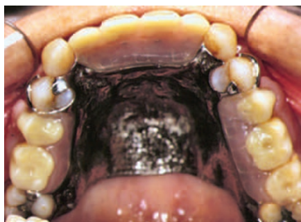
Fig. 10 The patient is wearing a tooth-supported upper removable partial denture

The placement of non-yielding restorations that are 'high' usually results in some acute discomfort, which varies with the level of occlusal forces transmitted to the periodontal and other tissues and the adaptive capacity of the patient. If untreated, then in some instances the affected overloaded teeth may become increasingly mobile following alveolar bone resorption at sites of tissue injury, but there is no associated clinical attachment loss. Excessive occlusal forces, resulting in trauma from occlusion (occlusal trauma) as diagnosed by various clinical indicators, alone do not initiate either gingivitis or the formation of periodontal pockets. However, the presence of persistent occlusal discrepancies may result in persistent tooth mobility and less favourable reductions in