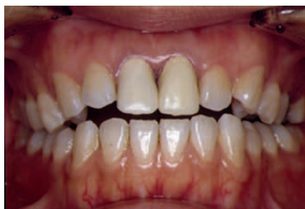
Fig. 3 Poorly fitting margins of interim crowns placed on the maxillary central incisor tooth preparations have resulted in plaque retention and gingivitis

Unlike dental floss, the brushes are effective in cleaning plaque from proximal root surface concavities and root furcations, and there is less risk of damaging periodontal tissues and cutting grooves into root surfaces, which may occur with improper use of dental floss. The use of dental floss also requires more manual dexterity, and there are often problems with the floss fraying and breaking when attempting to use it on restored proximal tooth contacts. Removing jammed frayed fibres from between the teeth is often very difficult for patients. The thicker fibres of Superfloss (Oral-B) have an embedded floss-threader to pass the Superfloss through the gingival embrasures when space permits. Superfloss can also be used to clean the undersurfaces of pontics of fixed prostheses and the proximal surfaces of teeth adjacent to edentulous spaces. Single-tufted brushes are very useful for cleaning tooth root surfaces with concavities and furcation entrances. Pulsating streams of water can physically remove loose debris from around orthodontic bands. Oral irrigating devices such as the Ultra Dental Waterjet (Waterpik Technologies, Inc.) may also be useful for gently flushing periodontal pockets with antimicrobials, such as 0.12% chlorhexidine solution, although this would not be a usual practice.