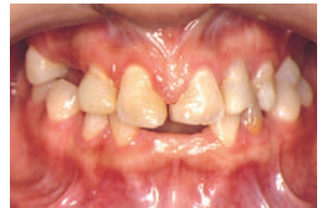
Fig. 5 Overhanging proximal margins of the resin composite restorations placed on the maxillary central incisors have resulted in plaque-induced gingivitis with gingival hyperplasia

Rough restoration surfaces, irrespective of the material, and open marginal gaps between restorations and contiguous tooth surfaces favour the attachment and growth of dental plaque. The surfaces of