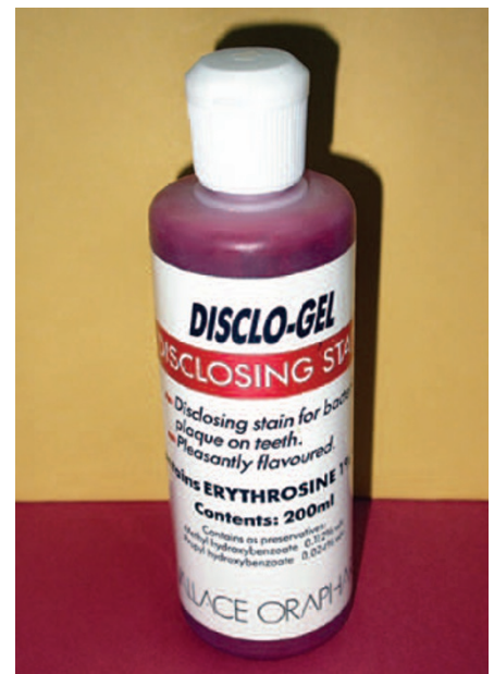
Fig. 2 Plaque disclosing gels, such as the one shown, allow patients to monitor the effectiveness of plaque removal

periodontal treatment planning. Effective long-term repeated removal of dental plaque is fundamental to the provision of periodontal therapy and the control of inflammatory periodontal disease. To achieve effective plaque removal daily at home, patients must be sufficiently educated and motivated, have adequate dexterity, and be able to obtain access to all tooth surfaces using appropriate mechanical and chemical cleaning methods. It should be made clear to patients that they are responsible for the continued control of their dental plaque. The acceptance of a behavioural change by the patient is usually required for effective plaque control, which is demonstrated by the normal colour and firmness of gingival tissues and the absence of bleeding on gentle probing.