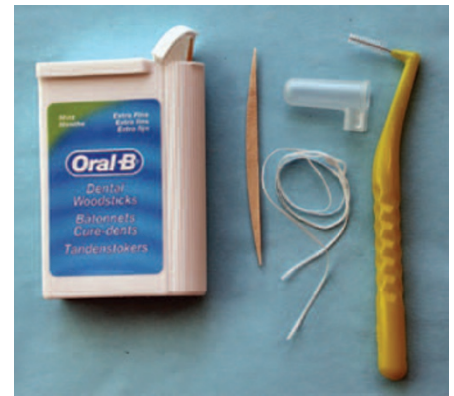
Fig. 1 Examples of oral hygiene aids for removing dental plaque from proximal tooth surfaces

The ability of patients to achieve effective, or otherwise, plaque control is an extremely important factor for subsequent