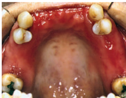
Fig. 11 Removal of the denture shown in Fig. 10 reveals that poor oral and denture hygiene have resulted in inflamed gingival and palatal tissues

periodontal probing depths and gains in clinical attachment in response to periodontal therapy, due to the lesser resistance to probing offered by periodontal tissues surrounding mobile teeth. In instances of very advanced periodontal destruction resulting from periodontitis, increased (or even normal) occlusal forces may become tantamount to extraction forces leading to progressively increasing tooth mobility, with the surrounding tissues offering less and less resistance to periodontal probing. Hence, though not necessarily related to the progression of periodontal disease, occlusal adjustments of high restorations and of functionally overloaded teeth improve the 'occlusal comfort' of patients by distributing occlusal forces to include other teeth.