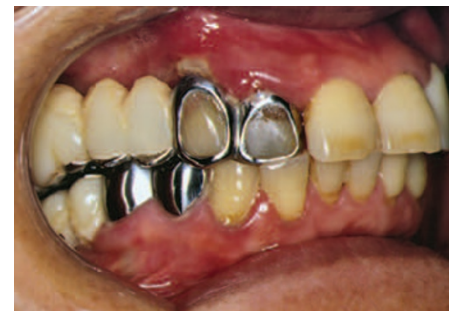
Fig. 6 Incorrect contours and overhanging margins of these preformed stainless steel prostheses, together with poor oral hygiene, have resulted in chronic periodontitis