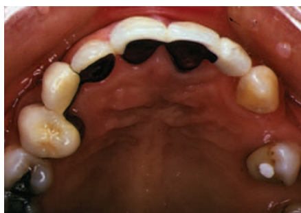
Fig. 9 In these two different fixed prosthesis designs, modified ridge lap pontics that facilitate plaque control have replaced a maxillary left lateral incisor and a right canine

diminishing fluoride release, and plaque retention is not obviously less than on other plastic restorative materials placed in similar tooth sites. For some materials, mastication of foods of varying abrasiveness leads to roughening of the occlusal surfaces of highly polished restorations, and to some polishing of rough restoration surfaces.