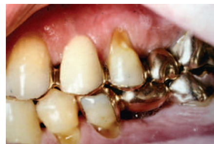
Fig. 4 Margins of these 12-year-old fixed prostheses have been placed supragingival where possible. Open gingival embrasures facilitate access for plaque removal

The periodontal tissues should be as healthy as is possible, without bleeding on probing, before elective restorative procedures are undertaken that impinge on the free gingival margins. The potential for iatrogenic tissue damage occurs during all operative dental treatment procedures. The gingival tissues should be handled gently, with care taken not to damage them unnecessarily