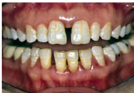
Fig. 12 A wide anterior diastema resulting from tooth drifting is present between the maxillary central incisor teeth in this patient with evident chronic periodontitis