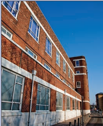
Manchester Dental School