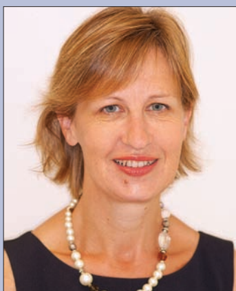
New Director appointed p351