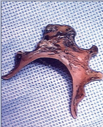
Dental plate (4.5 x 4.0 cm) removed from the hypopharynx p361