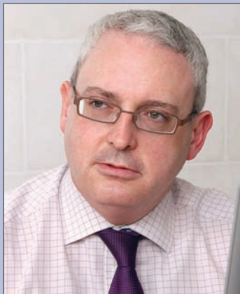
GDC Chief Executive resigns p349