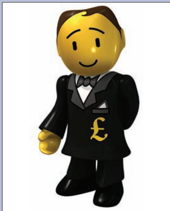
Invest in your practice with a cool million p394