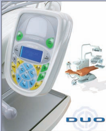
Multifunction foot control p390