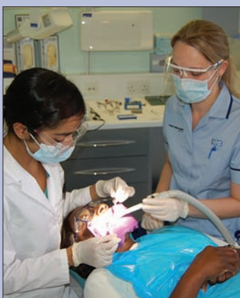
Four-handed dentistry at the Centre p371