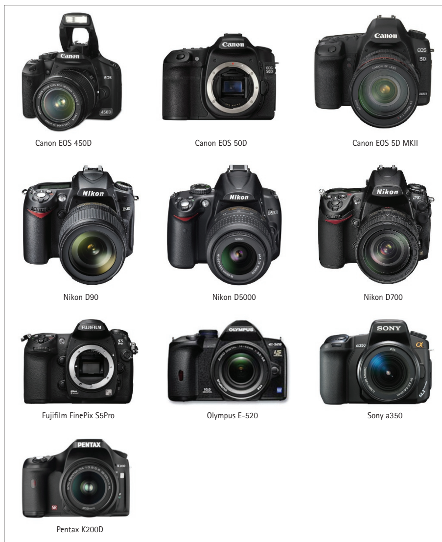
Fig. 11 A selection of semi-professional DSLR cameras, all approximately £500

A DSLR consists of a camera body housing the sensor, LCD viewer and microprocessor, which is the 'brain' of the camera (Figs 8-9). At one time it was a luxury to have a live video display on the LCD, but nowadays this feature is almost commonplace. However, it should be remembered that the video display lags behind what is observed in the viewfinder depending on the refresh rate of the LCD screen. The second component is the interchangeable lenses, which are selected according to the type of photographic application, for example macro, portrait, landscape, sports, wildlife, etc. A few DSLRs have fixed zoom lenses, which are usually incapable of taking macro dental images. The standard lens of a DSLR has a focal length of 50 mm; a shorter focal length lens, say 28 mm, is classified as wide angled (for example, for landscapes), while a longer focal length is a telephoto (for example, for sports or wildlife).