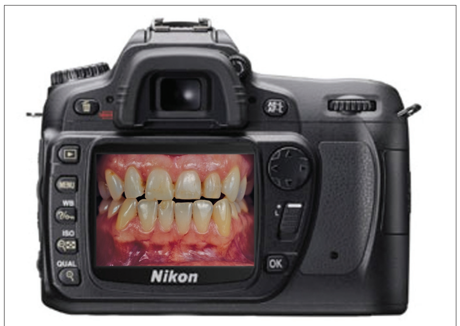
Fig. 9 The LCD viewer on the camera back allows a video display of the intended image, followed by instant viewing of the image after exposure