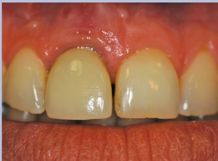
Poor image quality with inexpensive 10 megapixel camera, there is little detail of the soft tissues texture and poor depiction of tooth characterization

The hardware, and subsequent software processing and manipulation determine image quality. Returning to the acronym CPD (capture, processing, display) discussed in Part 3, how good the image looks is determined by method of capture (a function of lens quality together with the quality and quantity of pixels), method of in-camera processing (A/D converter) and the method used to display an image (monitor, prints).