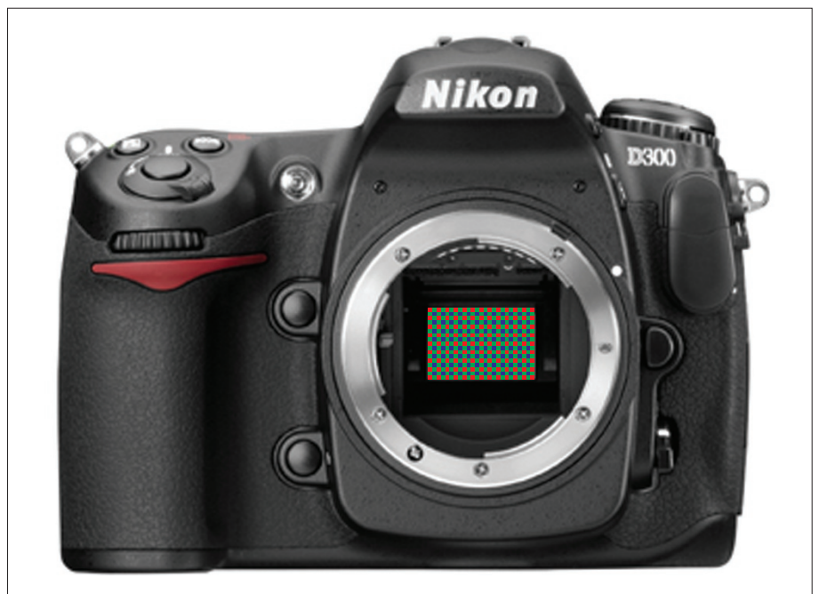
Fig. 8 The body of a DSLR houses the CCD sensor and electronics

Other cameras are the rangefinder varieties, for example compact 'point and shoot' that are unsuitable for dentistry because they suffer from parallax (Fig. 7). Parallax is defined as the difference between the image seen in a viewfinder and that recorded by a sensor. With macro photography, as the lens moves closer to the subject the variance increases, which means that certain