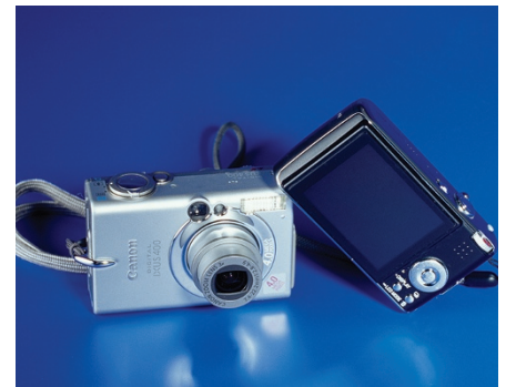
Fig. 7 Compact cameras are unsuitable for dental use due to the disadvantageous parallax phenomenon

The second is the Polaroid Marco 5 SLR camera, relatively inexpensive, with automatic exposure, auto-focusing and built-in flashes. Various pre-set magnifications are offered ranging from full face to a few teeth. The 'trademark' of Polaroid is self-developing prints, usually in a few minutes after taking the picture. The images are low quality, unable to be electronically archived, as only one print is produced for each exposure. The film is expensive because each print contains the developing chemicals. Before the advent of digital photography, Polaroid prints were the only method of instantly viewing a picture, but with the arrival of digital technology these cameras have become obsolete, having merely a novelty factor (Fig. 5).