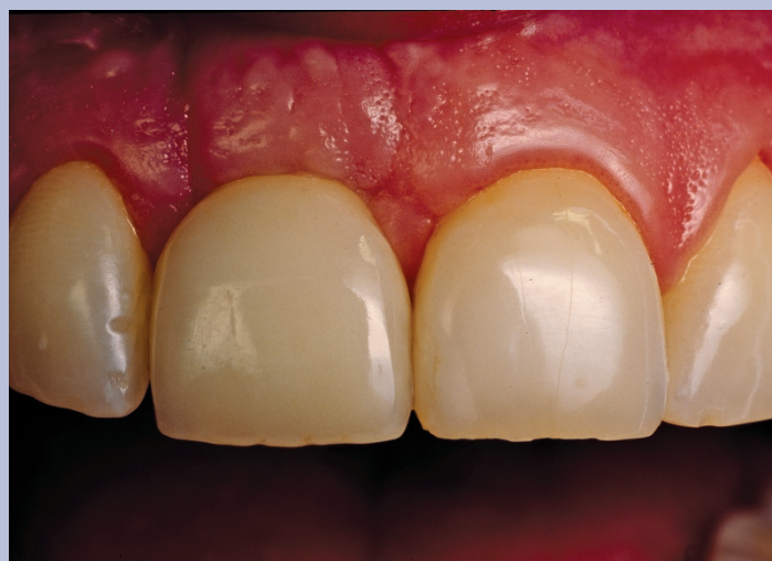
High image quality with expensive 10 megapixel camera, the soft tissue architecture and gingival stippling is clearly visible, as well as tooth stains, and fracture lines