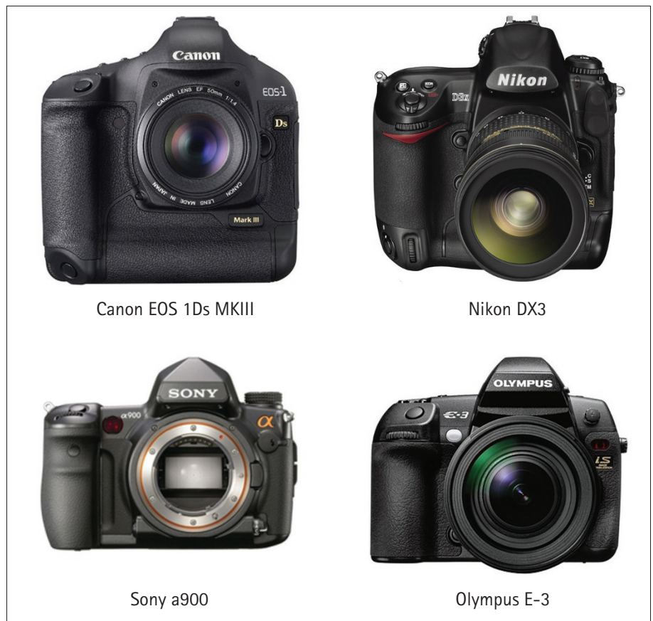
Fig. 12 A selection of professional DSLR cameras, from £800 to £6,000

It is difficult to recommend manufacturers or models of cameras, since the market is rapidly changing and new products are introduced annually or even every few months. The best way to choose a camera is to visit a retail showroom and check that a semi-professional DSLR meets the above criteria and specifications. Of course one can purchase high-end professional DSLRs