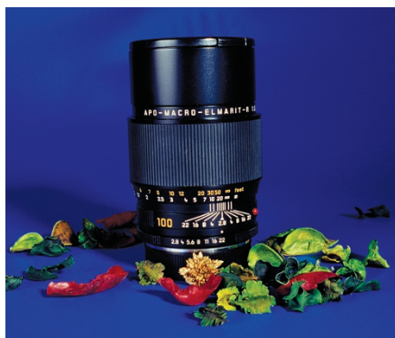
Fig. 10 A high quality macro-telephoto is the ideal lens for dental photography

teeth or parts of individual teeth may be missing on the resultant image. Some manufacturers have ingeniously overcome parallax by viewing and focusing attachments, all with limited success. This is analogous to buying a family saloon car and then customising it for formula one racing, which seems a little futile!