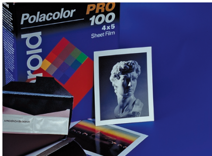
Fig. 5 Before digital photography, Polaroid instant films were the only method of previewing an image before making the final exposure