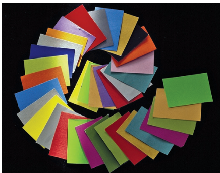
Fig. 15 A selection of coloured cards used as backdrops for photographic set-ups in a dental laboratory