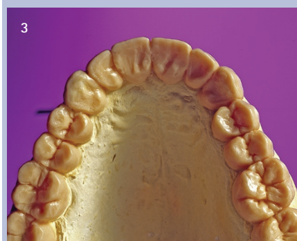
Figs 1-3 A camera for dental use should be capable of taking portraits as well as close up or macro images of the dentition and dental casts