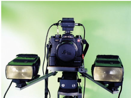
Fig. 14 The tripod supports a mechanical stage, flash brackets and the camera. A TTL adaptor mounted on top of the camera controls the bilateral flashes and exposure is made with cable release