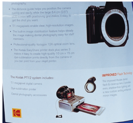
Fig. 6 The Kodak P712 digital camera system