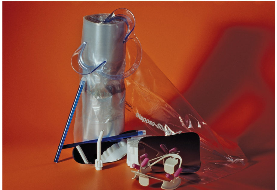
Fig. 16 The dental armamentarium required for dental photography

The predominant factor affecting image quality is the optics of the lens, discussed previously. Furthermore, as the physical pixel size decreases to cram more onto the limited surface area of a sensor, the demands on the lens to resolve detail increases. For example, purchasing a digital camera with a 10 megapixel sensor and attaching a lens capable of only resolving 6 megapixels of detail will do little to increase image quality. The quality of the pixels is determined by the type of sensor, either CCD (charge coupled device) or CMOS (complementary metal oxide semi-conductor). CCD sensors allow a larger bit depth (range of colours), higher dynamic range (increased contrast) and greater signal to noise ratios (avoiding grainy images). The CMOS are second-generation sensors with less power consumption, which allow access to individual pixels. Pictures taken with two different cameras with the same number of pixels will vary enormously because the quality of pixels is a crucial factor determining image quality. It is possible to purchase a relatively inexpensive compact camera