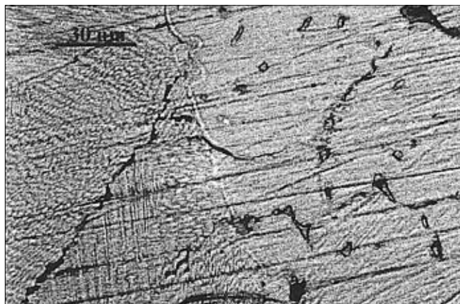
Fig. 3 Interface between welded area (left) and the cast alloy (Cs) showing the fine microstructure and the crack propagation along the grain boundary in the welded area.

The microstructure in the welded area is granular (about 300 µm for the mean grain size) and inside which there is a very fine cellular sub-structure with the same composition as in the initial alloy (Figure 3).