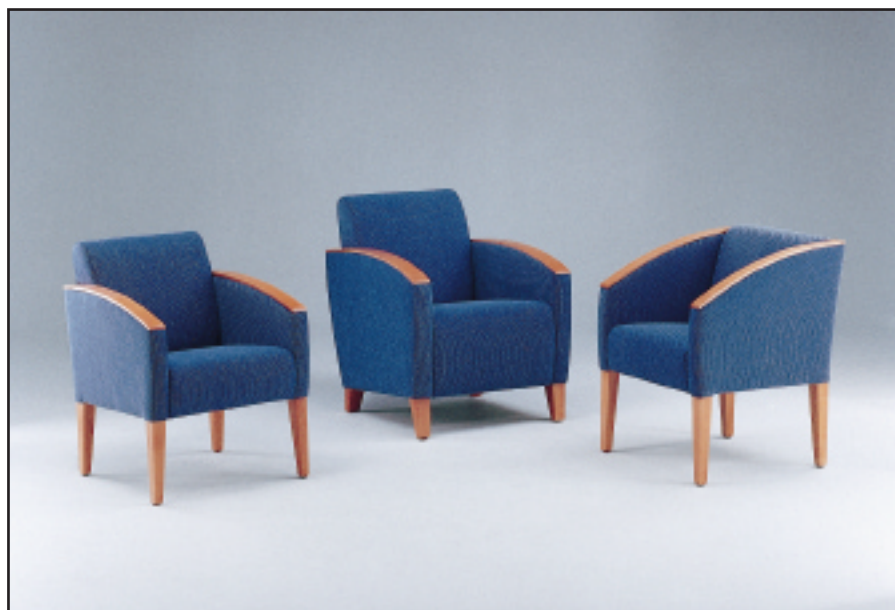
Above: Primo Furniture now has a new range and chairs and sofas, designed for reception areas. From left: models P806A, V1 and P805T.

IMZ Twin Plus is available in cylinder and screw forms. It features a patented