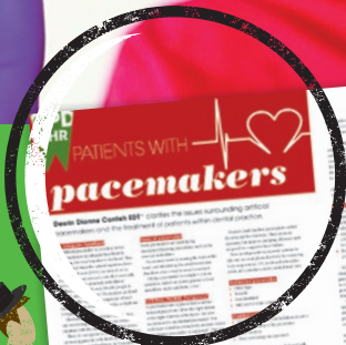
Perusing pacemakers, page 22