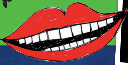
Is your policy a 10-fog duvet? Page 45