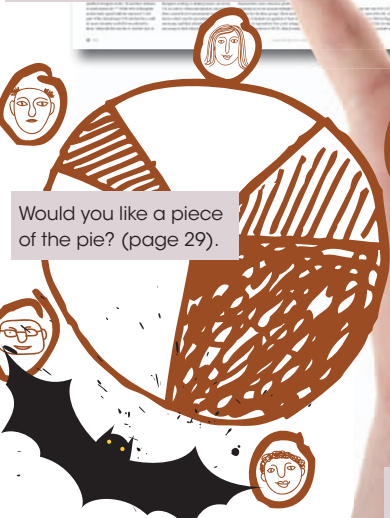
Would you like a piece of the pie? (page 29).