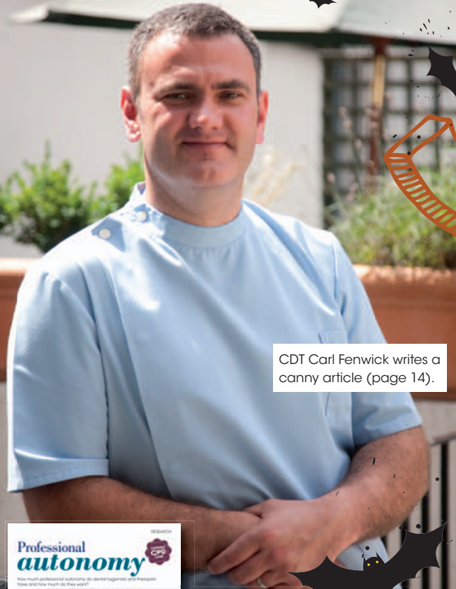
CDT Carl Fenwick writes a canny article (page 14).