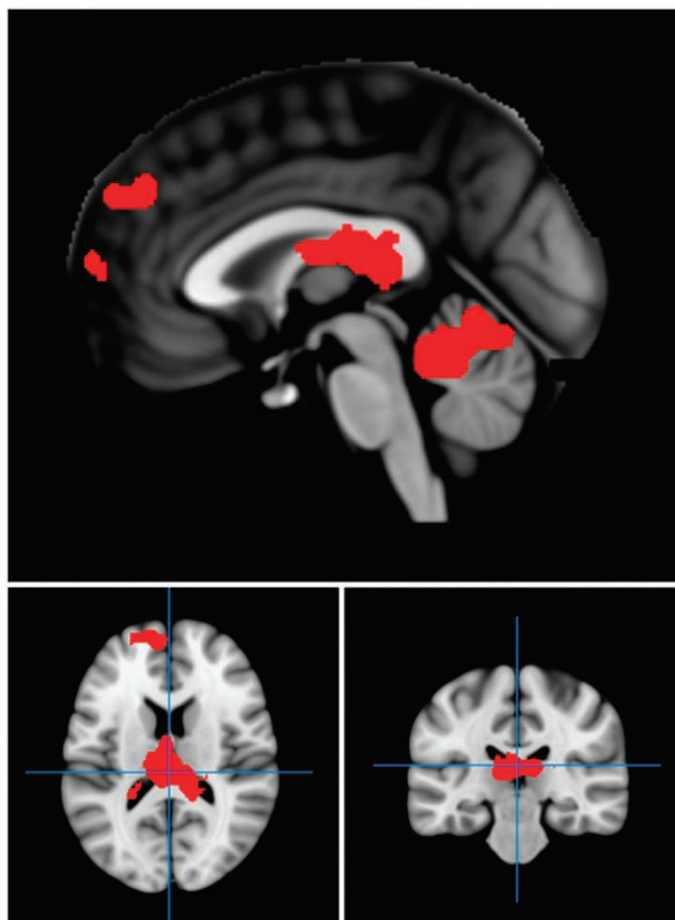
Figure 2. Regions of activation in medial frontal gyrus and cerebellum which correlated significantly with childhood physical abuse, as assessed by the CTQ, in those with borderline personality disorder. Red areas show activation meeting threshold P < 0.005 across whole brain, superimposed on the mean T1 image. CTQ, childhood trauma questionnaire.

to the cuneus. However, within the BPD group, a strong relationship was observed between childhood experiences of physical abuse and greater activation of the midbrain, medial frontal gyrus, pulvinar and cerebellum to emotional stimuli. Midbrain activation to emotional faces was additionally correlated with severity of current psychotic symptoms, especially persecutory beliefs. These results support an association between childhood trauma and long-lasting changes in brain responses to emotional stimuli. Although it is not possible to ascertain from the current study whether this effect is specific to BPD, such changes may contribute to the development of psychotic symptoms in adulthood, particularly at times of negative emotional stimulation.