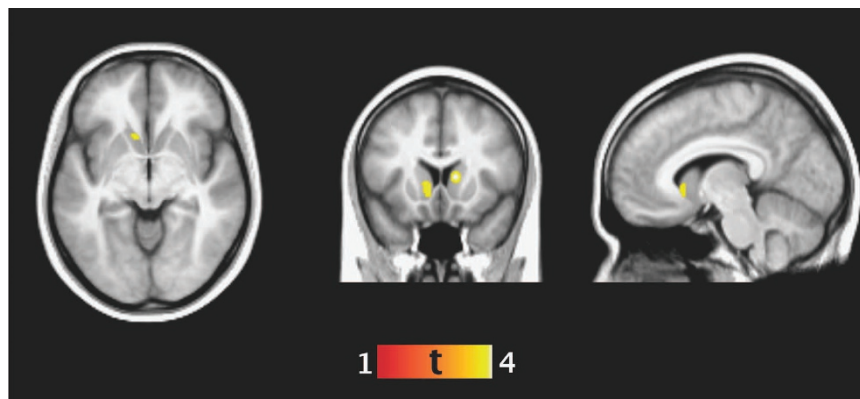
Figure 2. Lower ventral striatal D2/D3 binding associated with higher temporal discounting. The t -values for negative correlation between [ ^{11}C ]raclopride BP_{ND} and overall temporal discounting rate k in PG subjects ( n = 12 ) overlaid on the average T1-weighted image of the studied sample in Study 1. The images are thresholded to P_{FWE} < 0.05 , showing clusters of 147 voxels with peak pseudo- T 4.06 at 12, 15, 7 and 126 voxels with peak pseudo- T 4.03 at -10 16 -2 . Pseudo- T values are indicated with a red–yellow scale. The images are displayed in radiological convention (that is, the right side of the image corresponds to the left side of the patient) and coordinates are in Montreal Neurological Institute space (mm). BP_{ND} , non-displaceable binding potential; FWE, family-wise error.