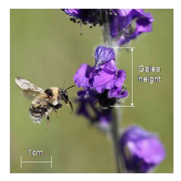
Figure 3. Flower and pollinator (Bombus sushkini) of Aconitum gymnandrum.

As in any study of natural selection in an undisturbed natural population, inferences about direct selection and adaptation come with the caveat that unmeasured traits that are correlated with the traits with significant selection gradients could be the actual adaptations and targets of direct selection<sup>32,33</sup>. Thus, our conclusion that the pattern of declining nectar production with higher floral positions is an adaptation based on the selection gradient results must be tempered by this caveat. However, the fact that our functional studies of bee movement with nectar position and the cost of geitonogamy to female fitness demonstrated by our hand pollination experiments make our inference that the nectar production pattern across the inflorescence is an adaptation stronger. In addition, because this trait is the difference in nectar production among flowers, it is at least partially decoupled from overall plant or flower size; indeed, the correlations with the other traits in the analysis are all <|0.4|. So our inference that the necar production pattern is an adaptation is strongly supported, but determining the fitness effects of experimental manipulations of this trait like those done by Waddington and Heinrich<sup>21</sup> are still an important goal for future work.