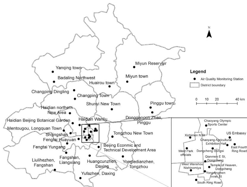
Figure 2. Air Quality Monitoring Stations in Beijing. The map is generated by the authors using ArcGIS 10.2.2 (www.esri.com).

We did not observe any explicit and universal weekly variation pattern after visual inspection over the two calendar plots (Fig. 1a,b) and further calculations. This finding suggests that the weekly cycle of human activities may not play a key role in determining variations in PM_{2.5} concentration. Our finding complements and improves previous studies that report weekly patterns in PM_{2.5} concentration in Beijing 9,13 .