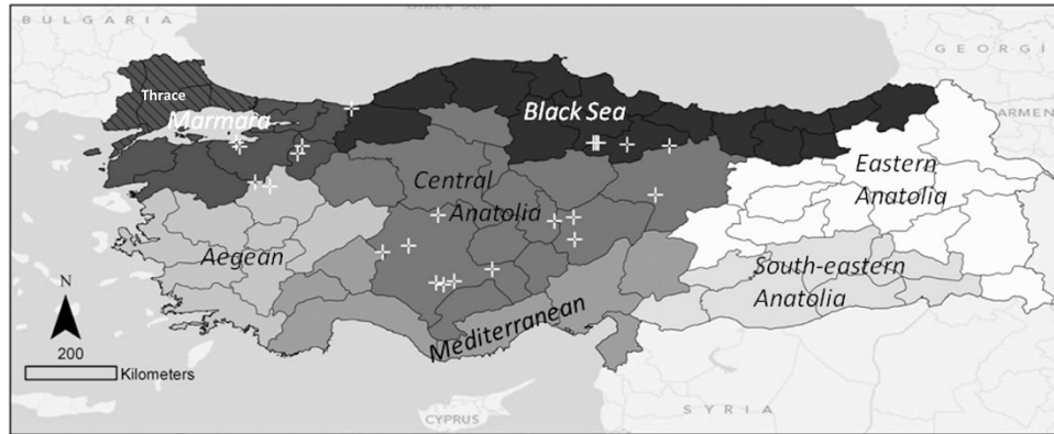
Figure 1. Map of Turkey. The locations of the 23 villages included in the prospective serological field survey used to inform the model in this study are marked with crosses 8 . The hashed lines show the FMD-free with vaccination zone of Thrace. Turkey consists of seven regions, divided into 81 provinces and 957 districts, containing about 48,000 villages. Created using ArcGIS ® software by Esri (ArcMAP10.3).

We previously assessed immune response in Turkish cattle after routine FMD vaccination under field conditions 8 . However, that study only assessed a small subgroup of the vaccinated population and did not take into account age structure of the population at large and population turnover. In addition, the vaccine history of those sampled did not reflect that of the population at large.