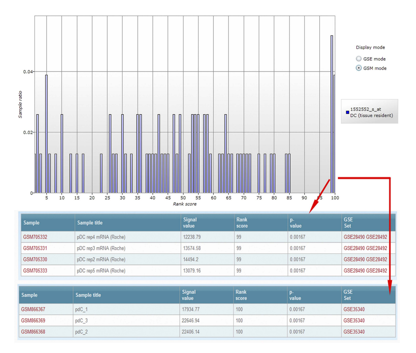
Figure 3. Electronic sorting of DCs with CLEC4C-bright expression. Top histogram indicates the expression profile of human CLEC4C in tissue resident DCs. Middle and bottom panels show cells (or GSM samples) with rank scores of 99 and 100, respectively.

the high or low expression states observed during electronic sorting may be due to either changes in gene regulation (or expressional plasticity) within a given cell type or changes in the relative abundance of different cell types. Electronic sorting does not resolve the contribution of different cell types to the global gene expression level in a mixed cell population. Expression deconvolution methods, such as CellMix<sup>22</sup>, can address this problem to some extent. However, computational deconvolution relies on marker gene expression of multiple cell types. We have established effective methods to evaluate quantitative biomarkers for human and mouse immune cells. This will no doubt contribute to deconvolution analysis.