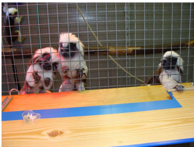
Figure 3 | Cotton-top tamarins during the group service experiment. The individual on the right hand side pulls the board closer to the wire-mesh grid of their home cage, which brings the transparent food bowl with the food reward on top of the board within reach of its group members. The pulling individual can not at the same time take the food for itself because the food is too far away and the board draws back as soon as the handle is released.

group (Cj_La(a) and Cj_La(b)) and the Nina group (Cj_Ni(a) and Cj_Ni(b)) with an interval of 2 years and 3 months. In the groups that were tested twice, the breeding individuals had remained the same but the helper composition had changed because new infants were born in the group and/or helpers had been removed. For all 13 groups, data on social tolerance was collected, whereas we also collected proactive prosociality data for 7 of these groups. Data from overlapping groups was only available for social tolerance.