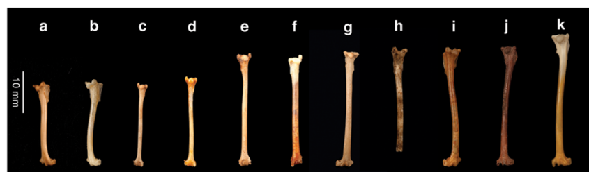
Figure 1 | Bat humeri. (a), (c), (e), (g), and (j) are late Holocene fossils from Ralph's Cave, Abaco. (h) is a late Holocene fossil from Trouing Jeremie, Haiti. (b), (d), (f), (i), and (k) are modern specimens. Monophyllus redmani (a, b). Myotis austroriparius (c, d). Lasiurus borealis cf. minor (e, f). Natalus primus (g). Macrotus waterhousii (h, i). Pteronotus parnellii (j, k). Mo. redmani UF 14826, Haiti (b). My. austroriparius UF 24049, Florida (d). L. borealis cf. minor UF 30161, Florida (f). Ma. waterhousii UF 20812, Haiti (i). P. parnellii UF 6947, Guatemala (k).

Modern and Past Locality Records. The three focal species of bat vary in their modern and past distributions (Supplementary Fig. S1). We compiled 168 modern localities and 41 fossil localities for Ma. waterhousii (Supplementary Fig. S1), which occurs today throughout The Bahamas, Cuba, Hispaniola, and Jamaica, and has been documented as a fossil on Puerto Rico, Anguilla, and Antigua 1,5,10,24,25 . We compiled 143 modern and 16 fossil localities for Mo. redmani (Supplementary Fig. S1), which now occurs in the Greater Antilles, Crooked and Acklins Islands (The Bahamas), and the Turks and Caicos Islands 26 , with a fossil record from Abaco (herein). We compiled 115 modern and 13 fossil localities for P. parnellii (Supplementary Fig. S1), which currently occurs throughout the Greater Antilles 27 and also is widespread on the mainland from Mexico to Brazil 28 ; it formerly occurred on Abaco and on Antigua 10,21,29 (also see Results herein).