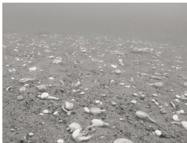
Figure 1 | Dead adult bivalves on the sediment surface after a hypoxic disturbance event, which resulted in major changes in ecosystem function. The bivalves Mya arenaria and Macoma balthica are comparatively long-lived and the mature stages may take 5–10 years to re-establish after disturbance.

The two different sampling occasions were combined in our analysis of both macrofauna and fluxes to increase replication of our study. Bottom water temperature was 19°C at T1 and 13°C at T2. Water column concentrations of oxygen and nutrients differed slightly