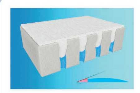
Prepared dentine including smear layer

In Clearfil Universal Bond Quick, we use a newly developed cocktail of hydrophilic monomers or hydrophilic amide monomers, to be more precise. Kuraray Noritake is renowned for superior bonding techniques and UBQ is no exception. The R&D