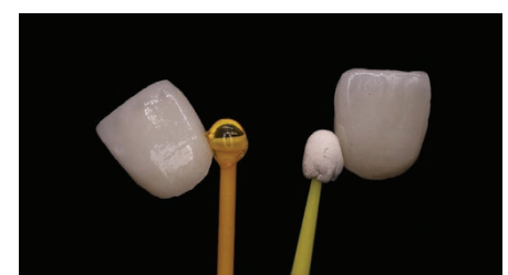
Fig. 4 Adapting the tacky putty to the dry glazed surface of the restoration