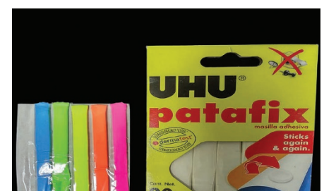
Fig. 2 Adapting a piece of tacky putty to the microbrush with dry hands