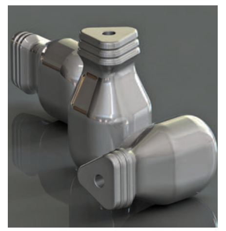
The toothbrush combines a disposable brush-head with a handle that is similar to that found on a screwdriver

Mr Hodgkison hopes to have his product on the market within the next five years.