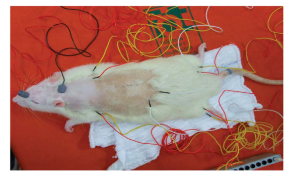
Figure 1 Positioning of electrodes on the anesthetized rat for the motorevoked potential exam.

intraperitoneal pentobarbital was administered after anesthesia. The spinal cord was dissected from C3 to T10 and fixed in formalin at 10%.