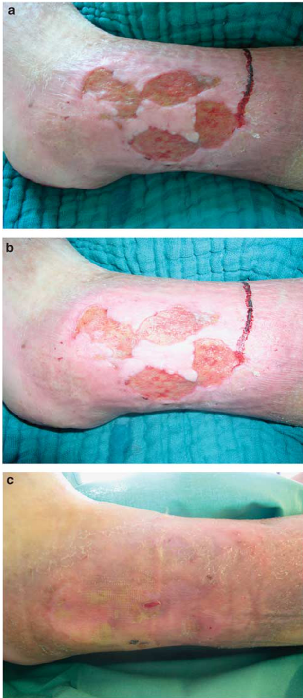
Figure 3 Patient number 7 (Table 1). A 51-year-old male paraplegic (L1) patient with ankle ulcer grade 3 NPUAP 6 with Methicillin-resistant Staphylococcus aureus . (a) First photo documentation. (b) Second photo, 2 weeks after Medihoney treatment. (c) Third photo, 4 weeks after Medihoney treatment, with eradication of Methicillin-resistant Staphylococcus aureus .

participants and 5 clinical trials of other forms involving 97 participants, collectively demonstrate that honey is an effective treatment for wounds.