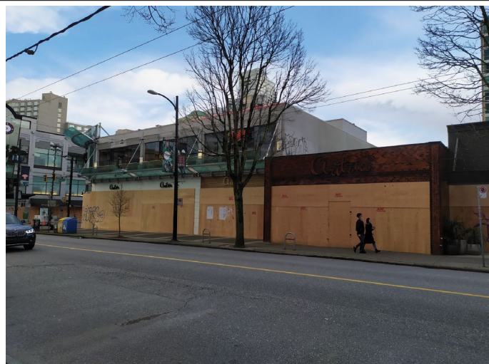
A boarded-up street in Vancouver, Canada, in March 2020.

Importantly, the authors also support the earlier finding that governance and cultural factors are at least as important as density in shaping the potential incidence of COVID-19 6 . Throughout the pandemic, not only did national and city governments adopt different approaches to managing densities and controlling populations, but citizens also responded differently to these measures. The timing of the restrictions differed from place to place as well, depending on the severity of the outbreak and political ideology. As such, while there is theoretically a positive correlation between neighbourhood density and COVID-19 infection rates, the authors point out that this is rarely the case in practice, owing to behavioural factors. For instance, as neighbourhood density increases, residents will be more likely to adopt social distancing practices to reduce their number of close contacts and their risk of infection.