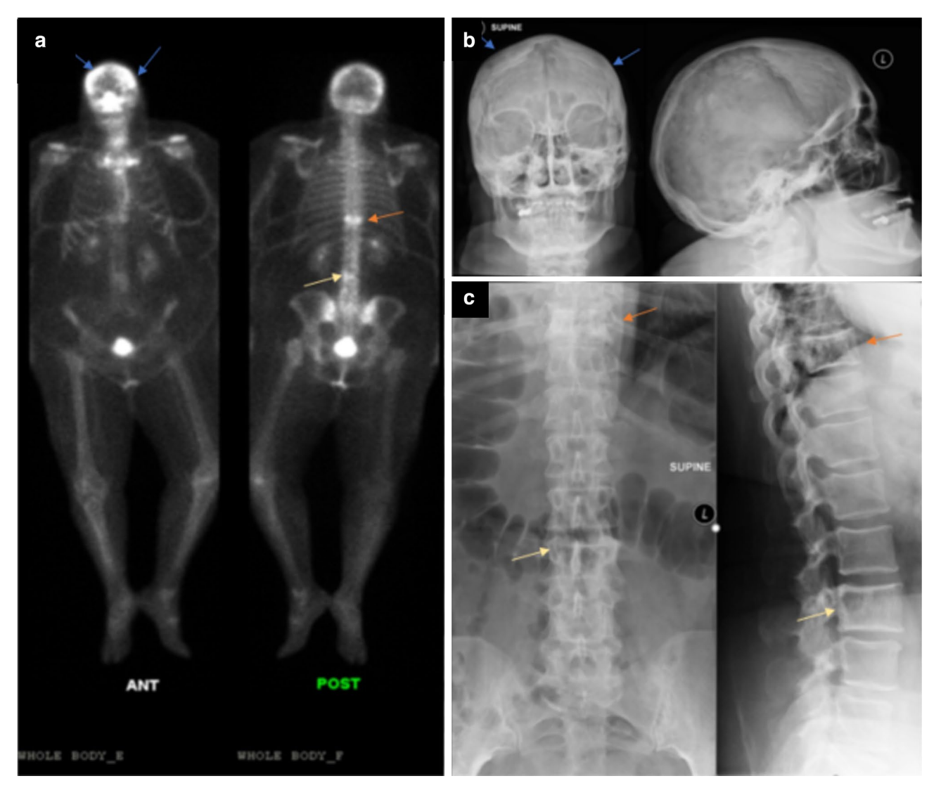
Figure 1. Whole body 99mTc-MDP bone Scan and Radiographic findings in patient 1 (ID 1). A 60-yearsold female with back pain and leg pain, limb girdle distribution of myopathy and Paget disease revealed ( a ) increased uptake in the skull, thoracic and lumbar vertebrae on whole-body bone scan, increased uptake in the knees due to associated arthritis, ( b ) radiograph images reveal corresponding bone lesions of the skull bilaterally (blue arrows), ( c ) thoracic T10 vertebrae (orange arrow) and lumbar L3 vertebrae (yellow arrow).

and thoracic spine, clavicle, and scapula. DJD affected areas such as clavicle, bilateral shoulders, sternoclavicular joints, and left patella were seen in one pre-symptomatic carrier.