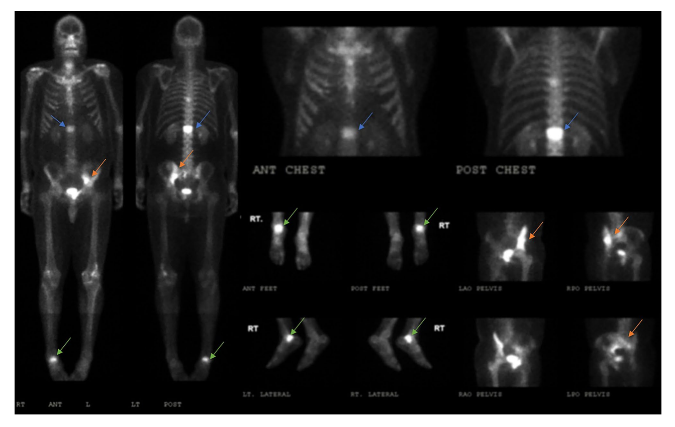
Figure 2. Whole body 99mTc-MDP bone scan and multiple spot views images of patient 2 (ID 2). A 43-yearsold male with inclusion body myopathy, and previously diagnosed Paget's disease revealed positive tracer uptake in the spine (blue arrow), left iliac bone (orange arrow) and right ankle (green arrow).