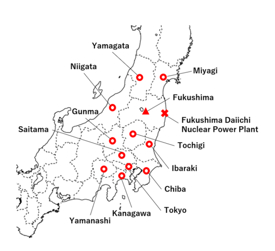
Figure 1. A map of prefectures where destination hospitals for psychiatric patients evacuated because of the FDNPP accident are located. Destinations are shown as circles. The triangle shows Fukushima prefecture, which includes the hospitals where evacuated psychiatric inpatients had been hospitalized before the GEJE and FDNPP. The cross shows the FDNPP. Microsoft PowerPoint (https://www.microsoft.com/en-us/microsoft-365/powerpoint) version 2016 was used to create the map.