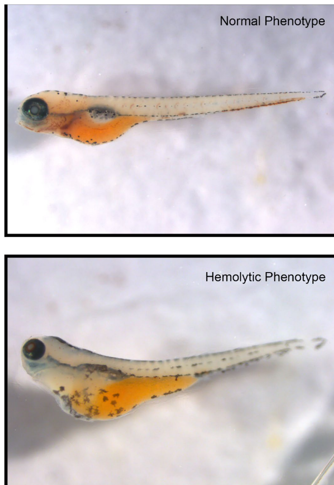
Figure 2. Hemolysis in a G6PD-deficient zebrafish model. Top micrograph shows a zebrafish at 72 hpf with intact red blood cells. Bottom micrograph shows an edematous G6PD-deficient zebrafish at 72 hpf after 48 h of methylated spirit exposure. Both animals were subject to o-dianisidine staining to show hemoglobin containing red cells. Zebrafish were imaged using a Leica DFC340FX fluorescent microscope with PlanAPO 1.6x/0.05 NA objective. Image capture was performed with Leica Application Suite X 3.6.0.2010 ( https://www.leica-microsystems.com/products/microscope-software/p/leica-application-suite/ ).

Yoruba tea exposure produced a 11.0% increase in hemolytic phenotype in Random morphants and a 15.0% increase in G6PD morphants, though the difference was not statistically significant ( p = 0.42 ).