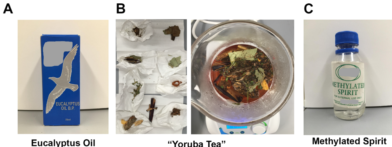
Figure 1. Compound tested in the G6PD-deficient zebrafish model. (A) Eucalyptus oil. (B) A variety of roots, bark, herbs to brew Yoruba tea (right panel). (C) Methylated spirits.

oil, methylated spirits, and traditional Yoruba tea for neonatal umbilical cord care as well as for general “healing properties.” Many of these infants going on to develop jaundice. With Nigeria having a high burden of G6PD deficiency 16 , large traditional remedy usage, and the recent prioritization of identification of effective treatments of neonatal jaundice by Nigerian pediatricians, it is important to explore the safety and impact of such treatments 12,17 .