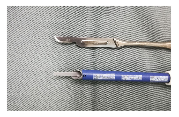
Figure 1. Schemas of the cold knife (up) and electrosurgical instrument (down). The trademarks have been marked.

clinicopathological characteristics and postoperative complications between various conization and suture methods in a large cohort of patients from a single study center.