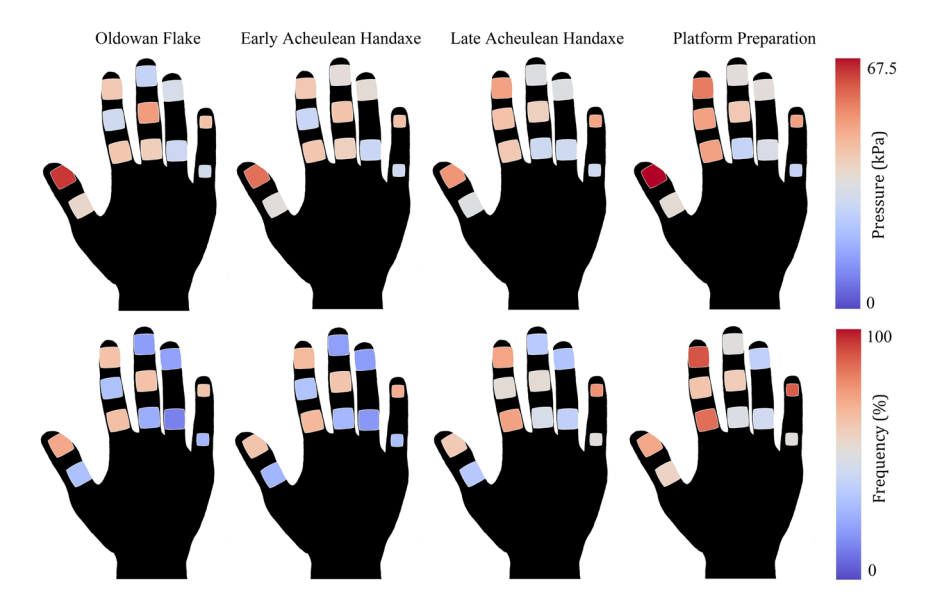
Figure 2. Colour maps detailing the distribution of mean pressure data (top row) and frequency of recruitment data (bottom row) during the four stone tool production behaviours.

greater results relative to the other sensors, in each of the four reduction types. Although relative to DP1, DP2 and DP5 these values were usually reduced. In comparison, the distal phalanx of digits three and four were not heavily loaded during the reduction behaviours. Nor were the proximal phalanges of digits one, three, four or five.